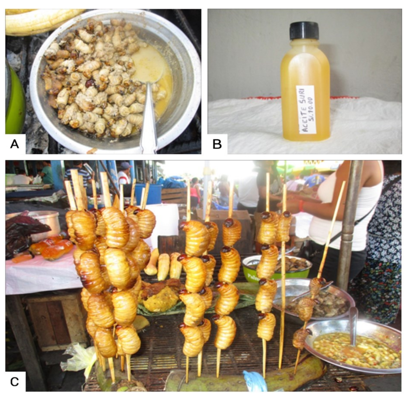
Figure 2 Commercialization of suri in local markets surrounding the indigenous communities surveyed. A Extraction of the suri oil in the Nanay market located in the Kukama-Kukamiria community; B Suri oil in a plastic bottle ready for commercialization in the Nanay market. A 40 mL bottle costs USD 3.09; C Roasted suri ready for consumption with tacacho or bananas.

perspective, the Kukama-Kukamiria belong to the Tupí-Guaraní family and the Awajúm to the Jíbaro family, while the Tikuna are considered an independent group belonging to the Tikuna family (MINEDU 2013). Currently, most members of these communities are bilingual – they speak Spanish and